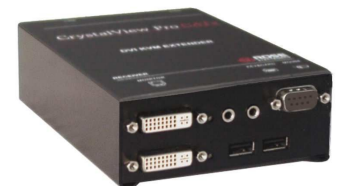
CrystalView DVI CATx (USB model)