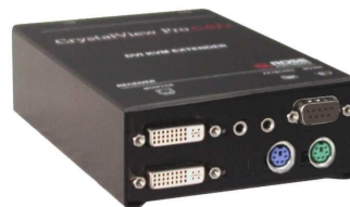
CrystalView DVI CATx (PS/2 model)