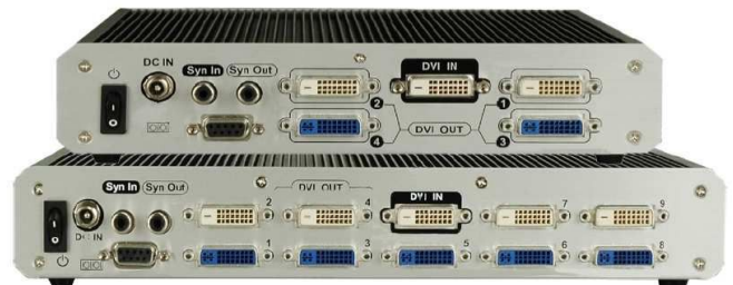
Top – VWL-B122D (2x2) Bottom – VWL-B133d (3x3)